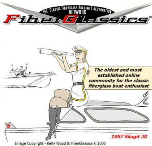
Figure 5. www.FiberClassics.com

Although old, restored fiberglass boats seem to blend well with the timeless designs typical of New England builders, some fiberglass powerboats hardly blend with today's styles. Sure you have a classic Bertram in the mix but some of the older powerboat classics took their styling cues quite literally from Detroit.