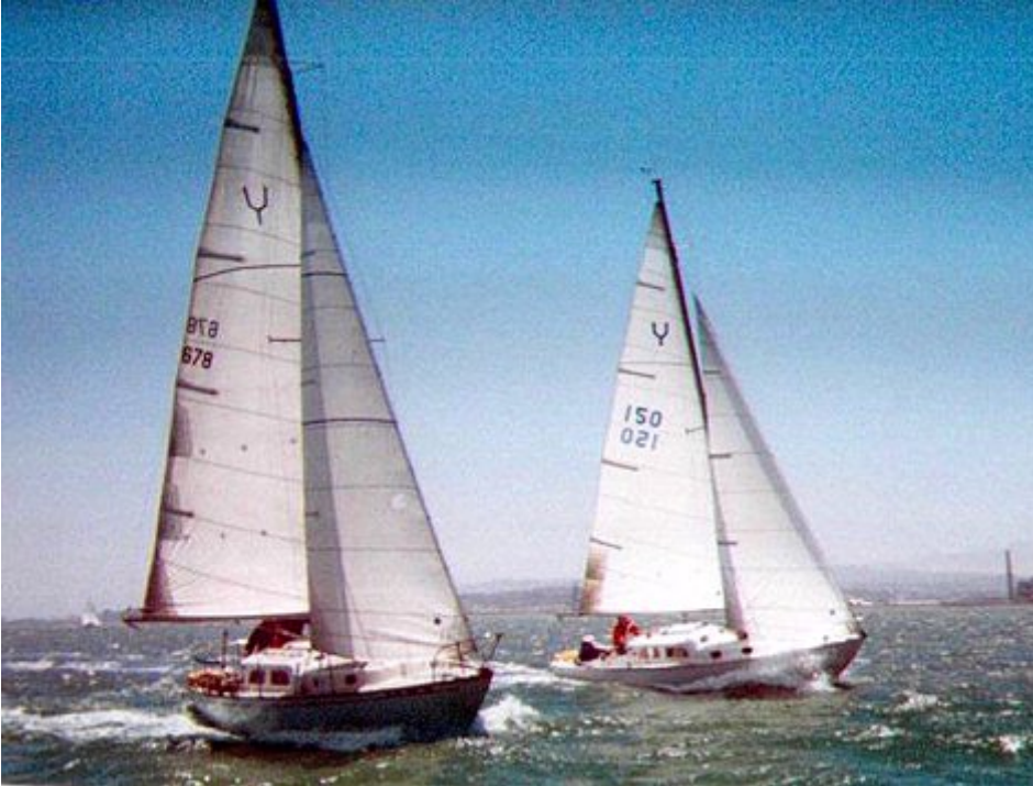
Figure 4. Two Classic Triton Sloops [ http://www.pearsontriton.com/history/billbell.shtml ]

A Northrop and Johnson ad in the Aug '60 "Yachting" cites the Triton sailboat as being introduced in Jan 1959. Sales to June 1960 were listed at 173 at a production schedule of 3 boats per week. The listed price was $9590 for the sloop. Everett Pearson developed the construction standards for fiberglass: "We designed the hull laminate from the waterline down so that the boat, laid over on its side with the entire weight of the boat resting on the keel and one square inch of the hull would yield not more than 1/2 inch and produce no structural damage to the boat." This is part of the reason so many of the early Tritons are still sailing today.