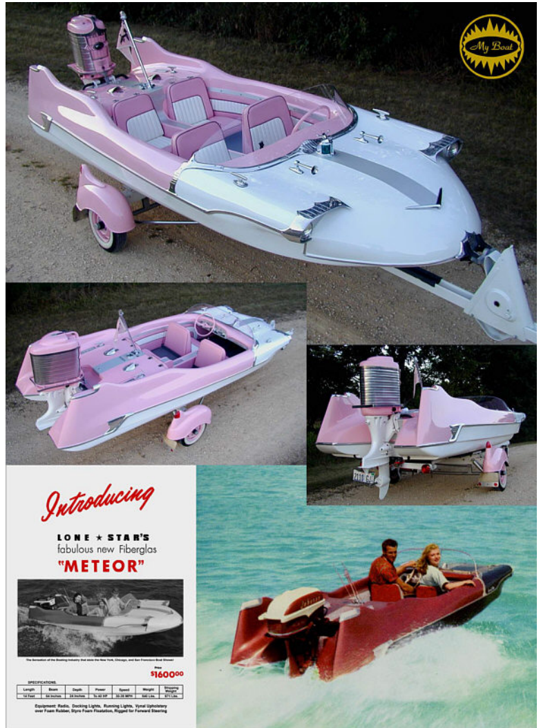
Figure 6. Carp DeVille from page 4 of "Boats in the Belfry- the KevFin Collection" [www.fiberglassclassics.com/galleries/bitb/default.htm]

Most gel coat on 50-year old fiberglass boats won't restore to showroom quality shown in Figure 6. Restored fiberglass boats of this era are now typically painted with polyester urethane topcoat, such as Awlgrip. However, we're still concerned about how long the mechanical properties of the pure laminate can last. Keep in mind that the part of the structure that will invariably fail first is not somewhere in the middle of a hull panel but at the edges where it is attached to hardware or bulkheads. Again, good selection of attachment methods and workmanship can drastically increase the life expectancy of an FRP structural detail.