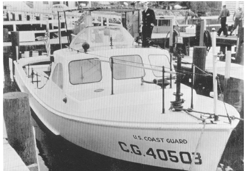
Figure 3. USCG Hull 40503 [Owens-Corning Fiberglass, Fiber Glass Marine Laminates, 20 Years of Proven Durability]