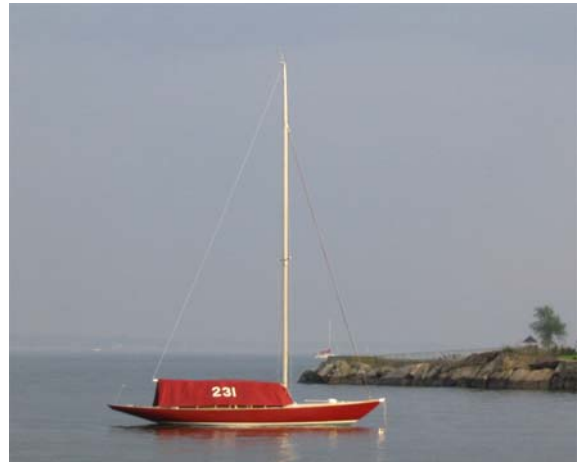
Figure 1 Pictures of Salvaged and Restored Shields Hull # 231

http://www.shieldsfleetone.org/Photos/Photos_231_Salvage/231%20salvage.htm