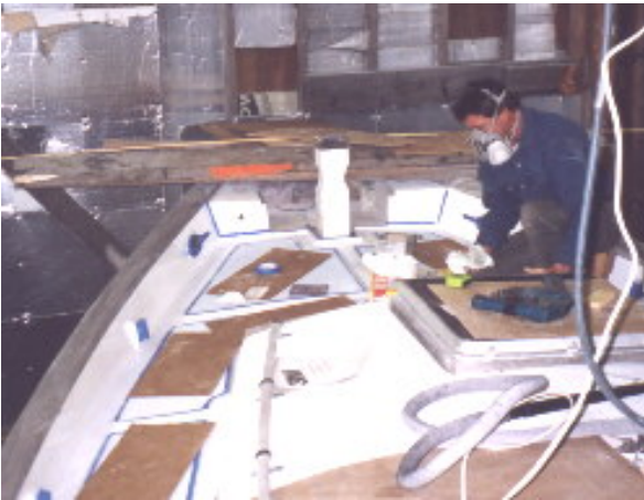
Figure 8. Deck “Re-coring” at Paul E. Luke, East Boothbay, Maine [ http://www.peluke.com/Yacht_Repair/yacht_repair.html ]

So what do all the tests and anecdotal evidence tell us about how long composites will last in a marine environment? Of course poor workmanship or improper use of materials can lead to premature structural failures, as observed by veteran repair shops such as Paul E. Luke. They find themselves working on aging fiberglass hulls that are often plagued with water impregnation of decks and bulkheads. They have extensive experience “re-coring” fiberglass decks and restoring the integrity of bulkheads with water damage, as shown in Figure 8.